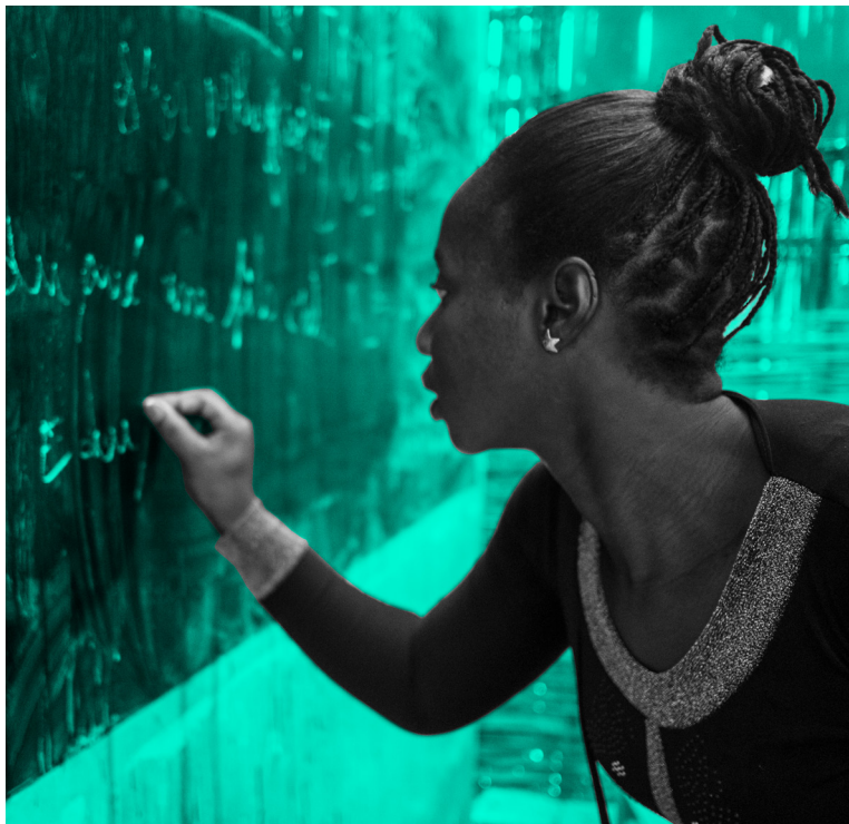
The EU-backed ISEM project has improved enrolment in secondary schools.

The ISEM project has led to 90% completion rates for targeted students. It is training teachers to support education for girls, in particular those who have dropped out of school. It also provides direct support to girls through the provision of bursaries and the establishment of peer learning structures within schools, along with reporting/case management structures to tackle the issue of gender-based violence.